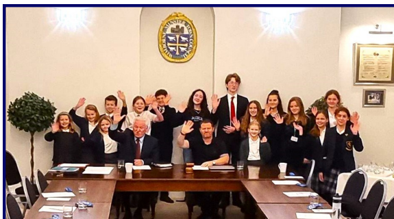
The first meeting of Wimborne Minster School Council on 21 November 2023.

TC/05/05 Support councillors via inductions, training and mentoring.