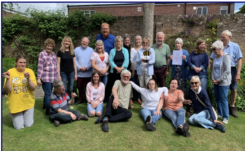
Members of Wilding Wimborne receiving the Bee Friendly Town award from the Bee Friendly Trust. Wimborne Minster was one of six towns awarded Bee Friendly status in 2022.

TC/02/07 Work with partners to develop and implement risk management and infrastructure plans, enhancing the town and our residents' resilience to climate-induced extreme weather events.