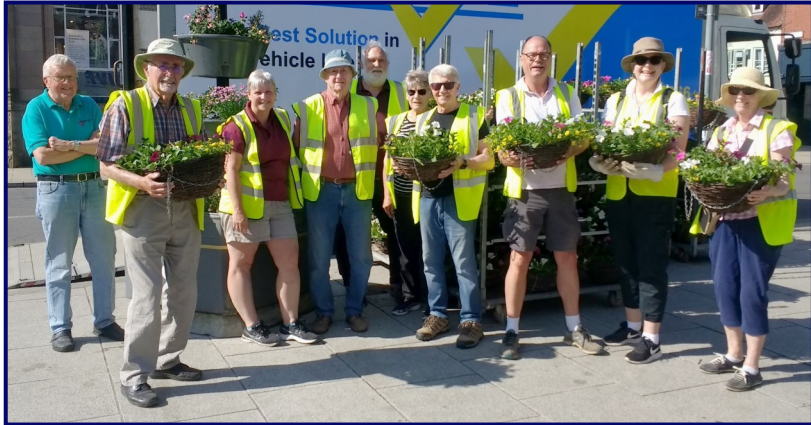
Wimborne in Bloom volunteers, image courtesy of Anthony Oliver.

TC/07/01 Work with Dorset Council on any agreed asset transfers.