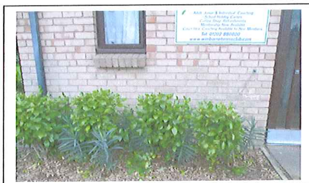
Why does the spurge not get pulled up?