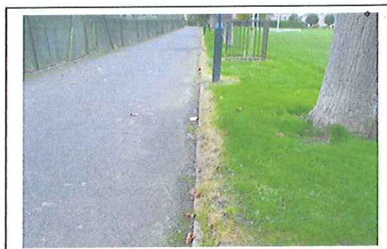
Resident asked why weed killer been used instead of edging?