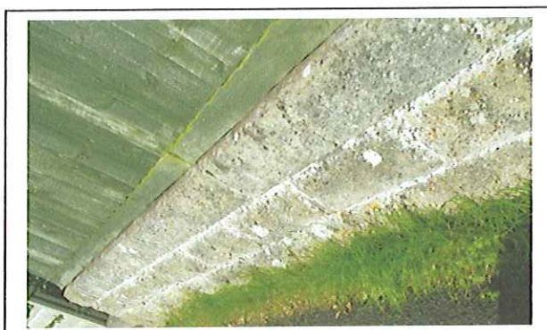
Weeds have still not been pulled up in Redcotts Lane (through Redcotts Recreation Ground) and none of the edging has been done or hedges cut back so the footpath is getting narrower and narrower in some parts for wheelchairs and pushchairs.