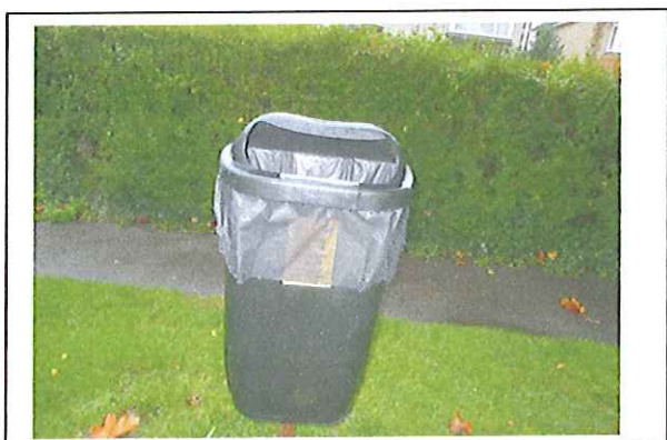
New stickers need to be larger and put lower down so bags do not cover them.